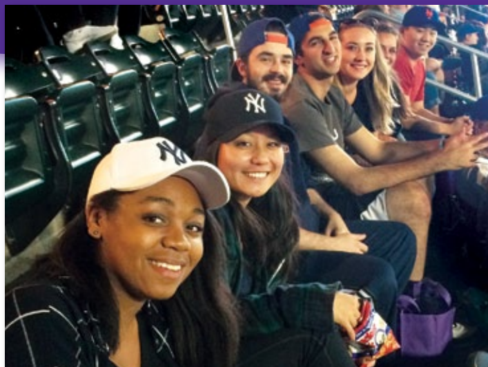
NYUSPS students watched the Yankees rout the Mets at Citi Field during a night out with the Undergraduate Student Council on September 20.