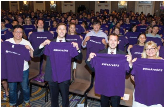
Students showed their school spirit during Graduate Orientation on August 31.

Students are getting the message out with a video that was specially created for Orientation and the initiation of Spirit Week. Take a look! bit.ly/WeAreSPS