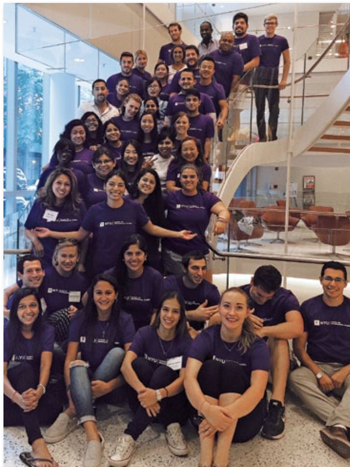
Undergraduate and Graduate Student Council and club leaders participated in a leadership training session in September to prepare for the new year.

MS candidate in Global Affairs, Center for Global Affairs